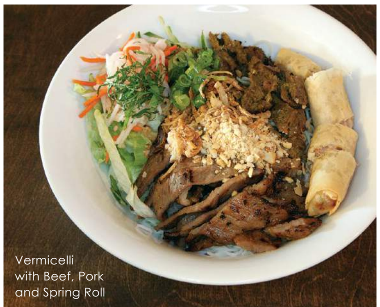
Vermicelli with Beef, Pork and Spring Roll