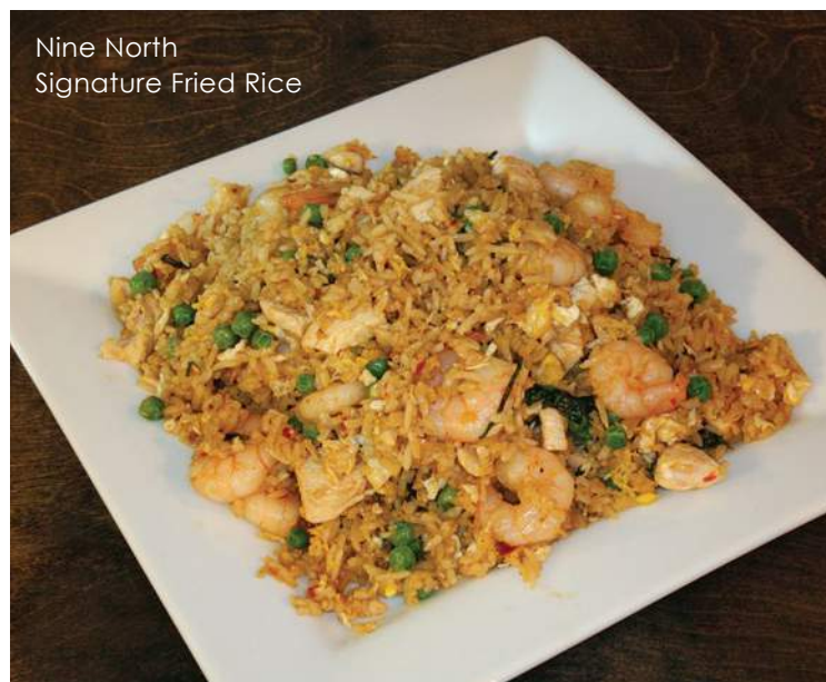
Nine North Signature Fried Rice

Our signature chicken and shrimp fried rice tossed in a mild pineapple sauce with bold spices and a hint of curry.