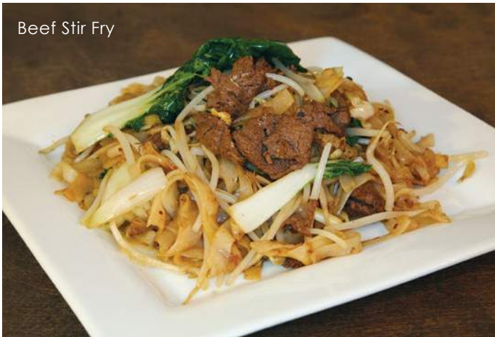
Beef Stir Fry

Beef stir fry with thick rice noodles and bean sprouts.