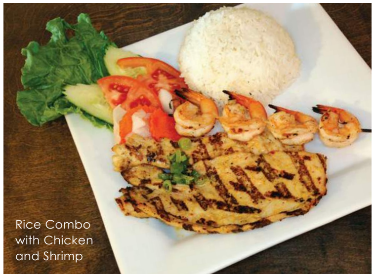
Rice Combo with Chicken and Shrimp

PLEASE NOTIFY YOUR SERVER OF ANY ALLERGIES