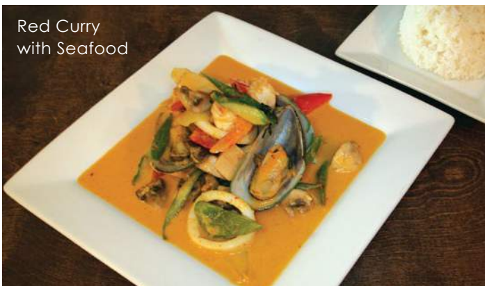
Red Curry with Seafood