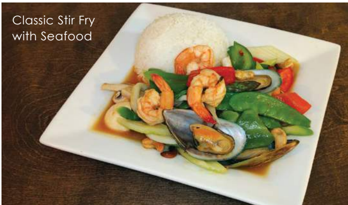
Classic Stir Fry with Seafood